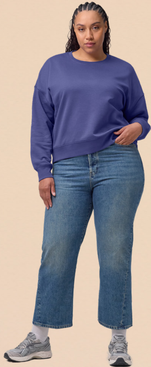
Stella Alma in Dusk Medium fit