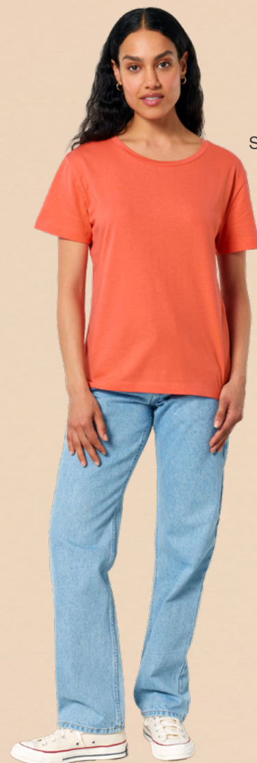
Stella Serena in Fiesta Medium fit