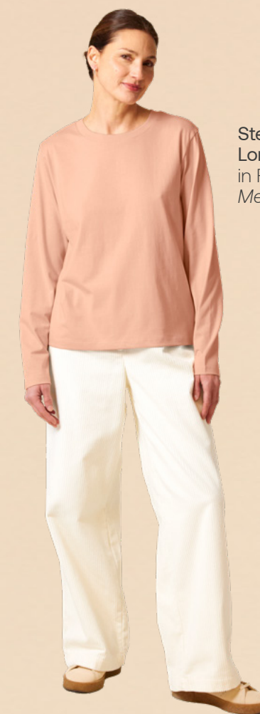
Stella Muser Long Sleeve in Fraiche Peche Medium fit