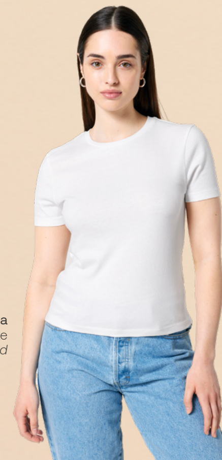
Stella Ella in White Fitted