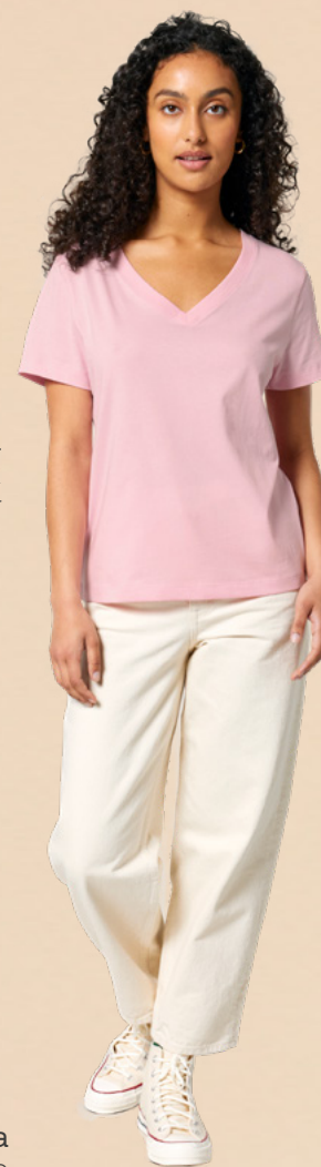
Stella Isla in Cotton Pink Medium fit