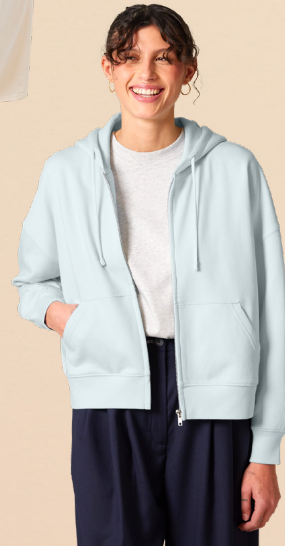
Stella Ida in Blue Ice Medium fit