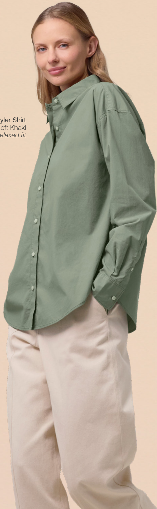
Stella Styler Shirt in Soft Khaki Relaxed fit