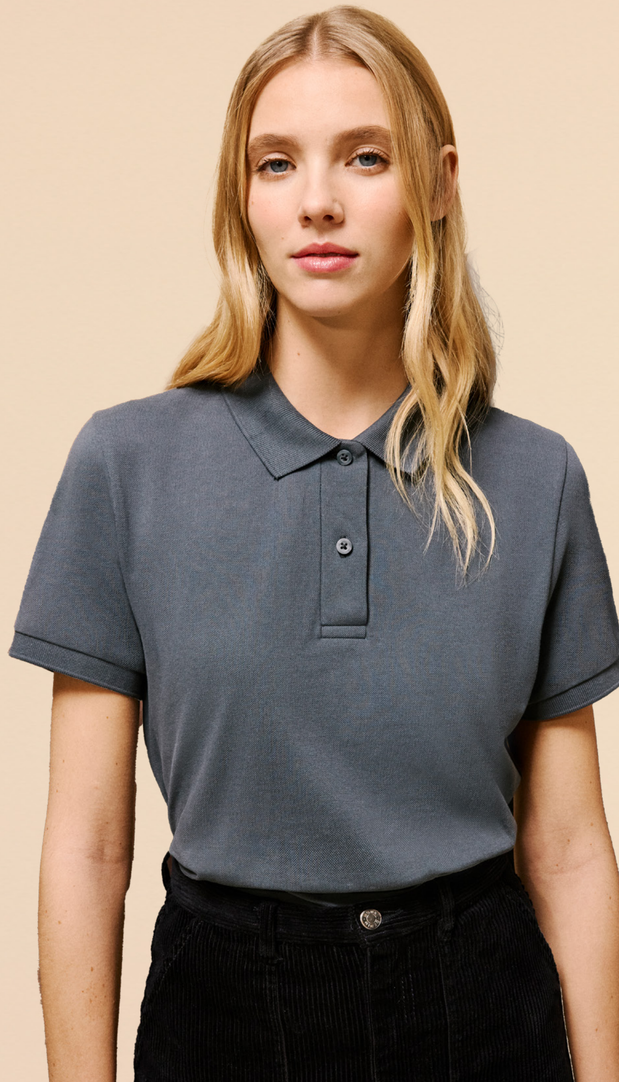
Stella Coaster in Anthracite Fitted

Alongside our Iconic unisex Prepster Polo, we introduce the Stella Coaster, a gender- fitted style ideal for warm weather and active environments, forming a perfect match with Stanley Coaster.