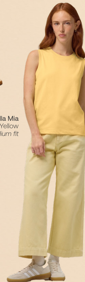
Stella Mia in Viva Yellow Medium fit