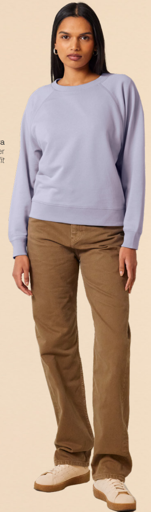
Stella Clara in Lavender Medium fit