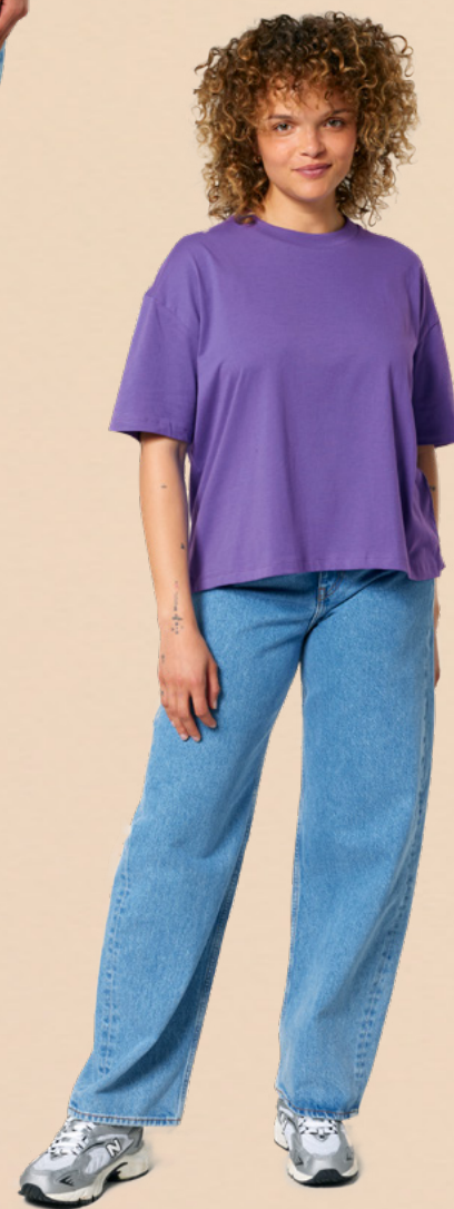
Stella Nova in Purple Love Relaxed fit