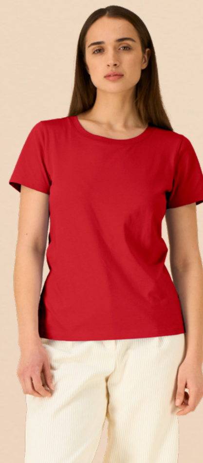
New Stella Expresser 2.0 in Red Medium fit