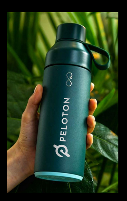
ECO-CONCIOUS MEANINGFUL MERCH