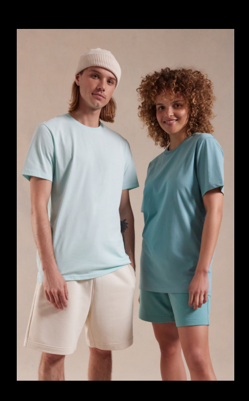
ETHICAL & SUSTAINABLE GARMENTS