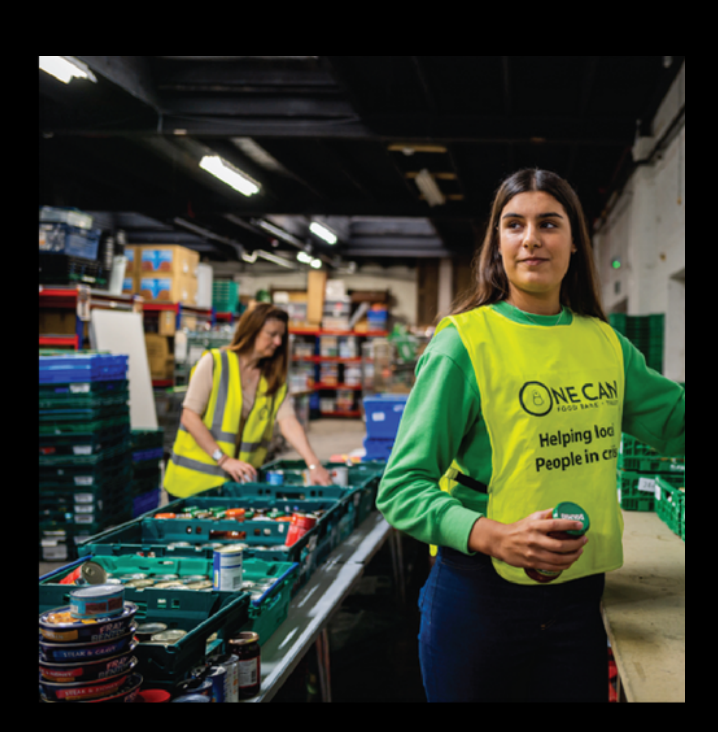
Team volunteering days to support our local community