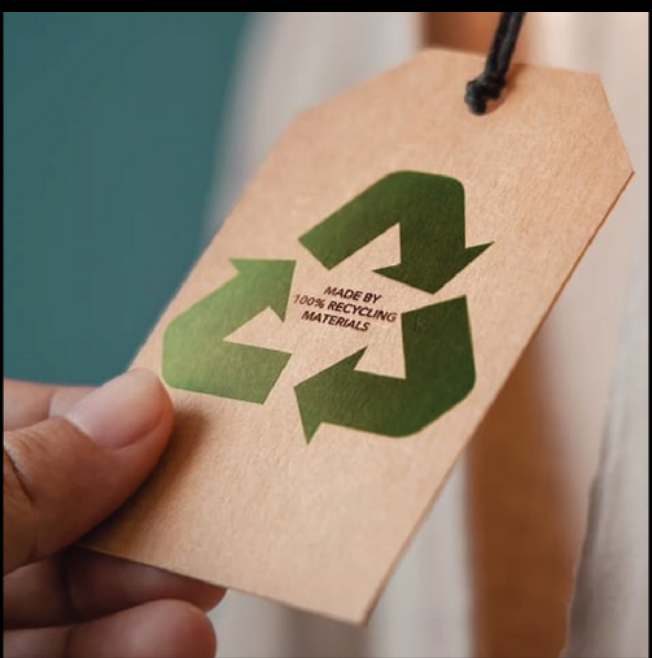
Offering sustainable options on all uniform quotations