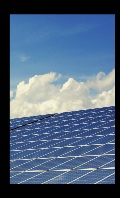
SOLAR POWERED PRODUCTION & EV DELIVERIES