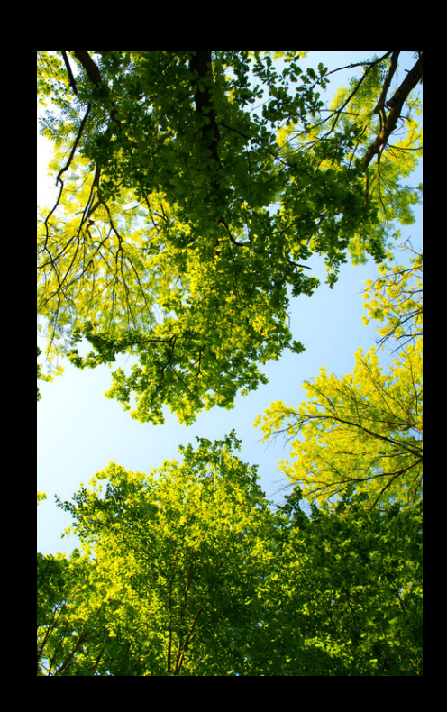
PLANTING TREES FOR EVERY ECO-ORDER

Combining sustainable production with ethical suppliers and responsible partners, we make sure every part of our supply chain is contributing to a greener future.