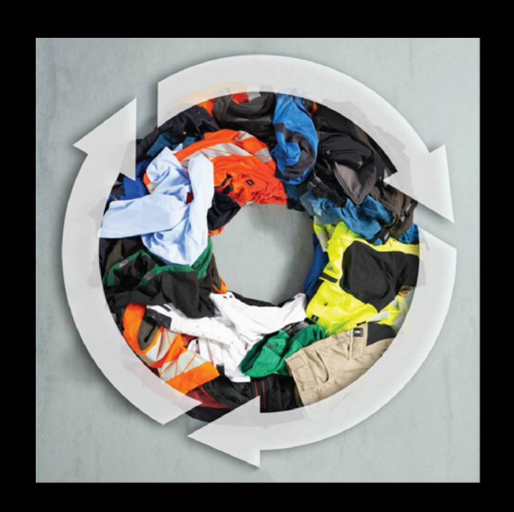
End of life workwear recycling

Building on our progress in 2023 this year we are launching several new projects to support our ESG strategy;